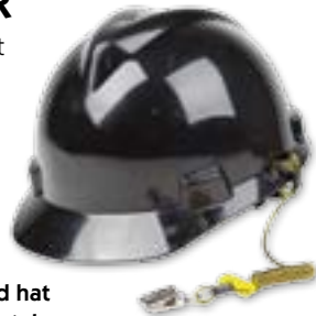
Hard hat sold separately